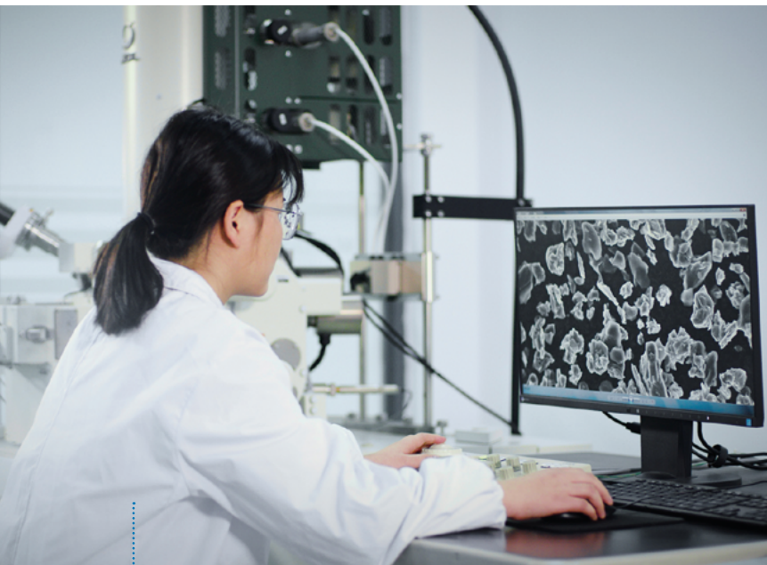
Highly valued service from Keda Suremaker: AAC production process technology laboratory.

Keda Suremaker's AAC plant solution can provide a complete project service roadmap, which is divided into four parts as follows.